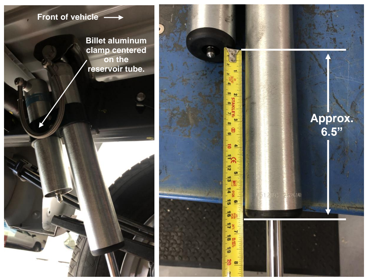
Figure 1. Driver Side