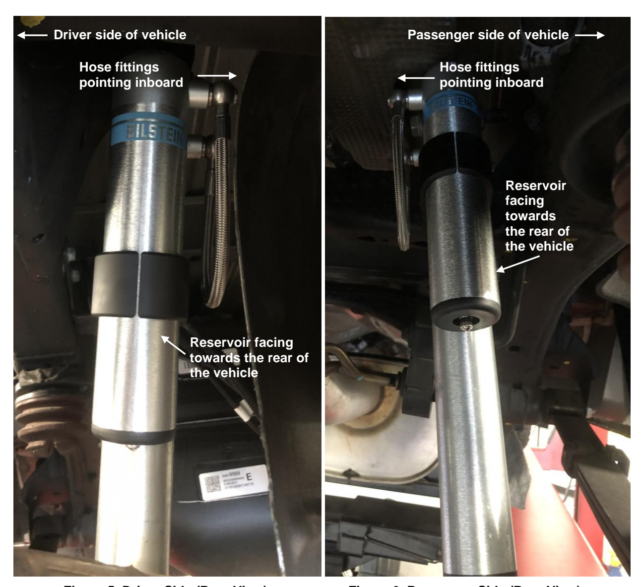
Figure 5. Driver Side (Rear View)